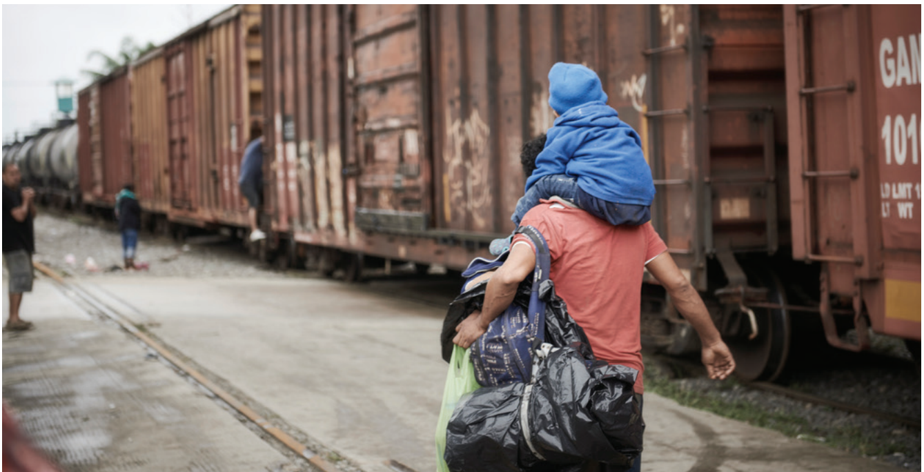
MSF teams have seen a general increase in the number of women, children and whole families traveling North. Image: Christina Simons/MSF, Mexico, December 2018.

People 'caught in limbo' often have to navigate clandestine spaces and find unconventional paths to ensure their safety and justice. 32 Many find themselves as unauthorized migrants with limited access to healthcare, particularly those residing in the southern states of Mexico, and often trapped between erratic state institutions and normative frameworks, criminal gangs, and alarmed locals. Faced with direct dangers, threats and day-to-day uncertainties, wellbeing and health, particularly mental health, become jeopardized for both migrants and host communities. 33